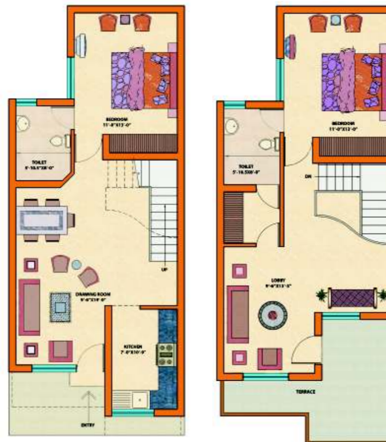
Ground Floor Plan Duplex Unit First Floor Plan Duplex Unit

Raglan Infrastructure Ltd. is undertaking the construction of project "Gulmohar City Extension" in the vicinity of earlier project Gulmohar City adjacent to Ambala - Chandigarh Highway at Derabassi. 60% of the total area is an open space in the shape of well developed parks, parking area, roads etc. Construction of Phase I, II & III has been completed and ready for possession.